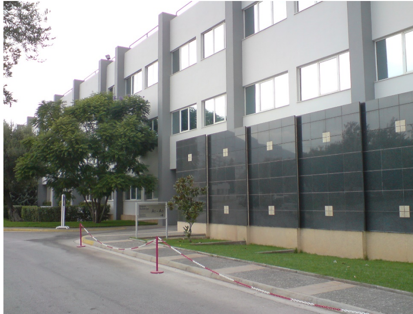
Intracom Telecom buildings A1-A3