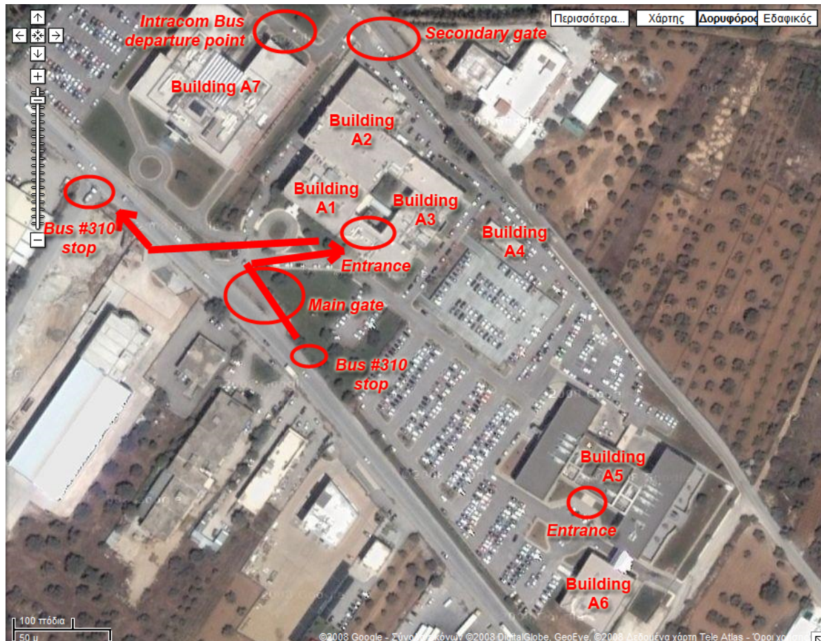
Intracom Telecom complex A (bus stop is the same for 307 and 310 which is indicated in the picture)

The meeting will be held at building A3 .